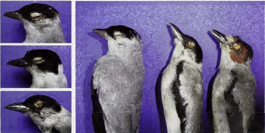
Figure 6 (left). Head views of the holotype of White-tailed Tityra T. leucura (top) and Black-crowned Tityra T. inquisitor pelzelni (middle) and T. i. albitorques (bottom) (E. Bauernfeind)